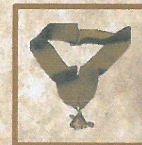
Green DSA Awarded Prior to 1965