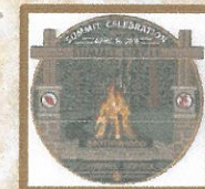
6" Summit Circle Dedication Patch April 2016