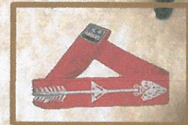
BSA 100 th Anniversary Commemorative Sash

SOME OF THE ITEMS THAT HAVE BEEN DONATED ARE PICTURED ON THE RIGHT SIDE OF THIS PAGE